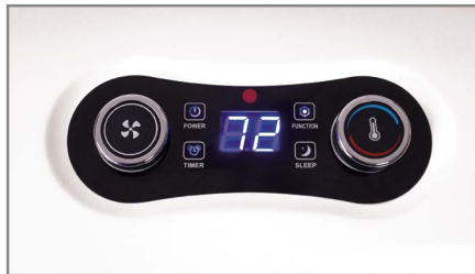
Controls feature large LED display and rotary dial fan and temperature adjustment