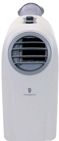
P08SA, P10SA, P12SA

You can quickly set up supplemental or emergency cooling for computer rooms.