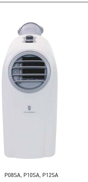
P08SA, P10SA, P12SA

You can quickly set up supplemental or emergency cooling for computer rooms.