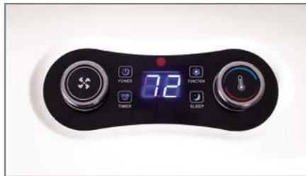
Controls feature large LED display and rotary dial fan and temperature adjustment