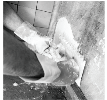
trowel one layer of thinset on the wall