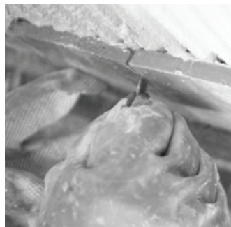
space zellige's uneven edges require wedge spacers