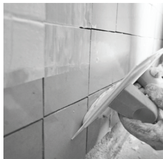
grout match glaze color