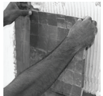
for mosaics mounted for easy installation