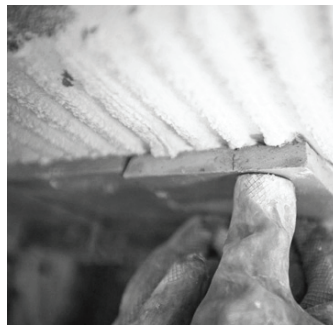
place tiles one by one into wall adhesive