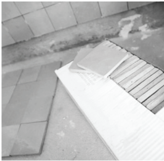
sort blend all boxes for shade variation