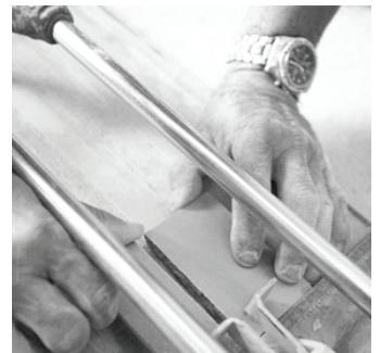
snap with tile cutter to cut