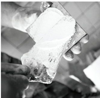
butter another layer of thinset on the back of the tile