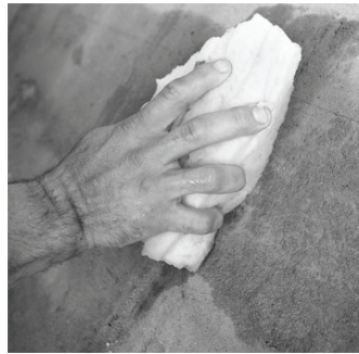
prep dust free and level walls