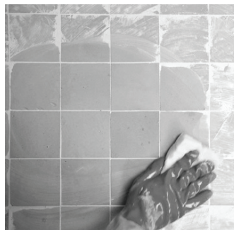
polish be sure not to leave grout film