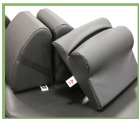
Knee & Cervical Bolster Set