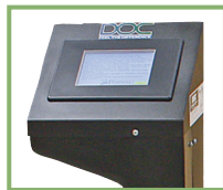
Digital Command Center with Preprogrammed Options