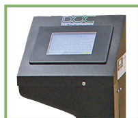
Digital Command Center with Preprogrammed Options