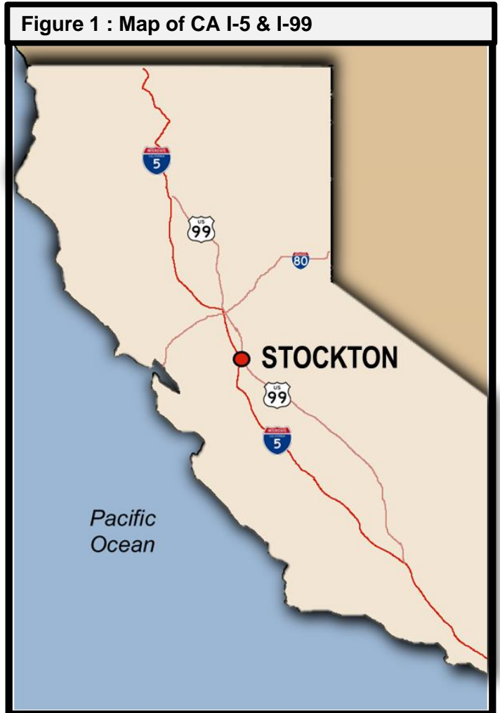
Figure 1 : Map of CA I-5 & I-99

Location. Location. Location. Stockton is conveniently located near where the I-5 and the I-99 meet making it an epicenter for transport. (See figure 1 to the right)