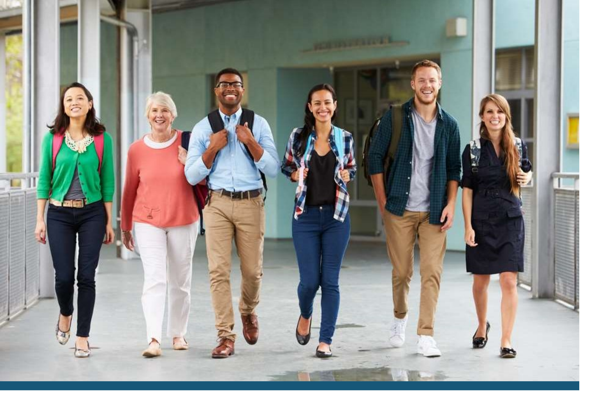
STRATEGIC GROWTH PLAN 2022