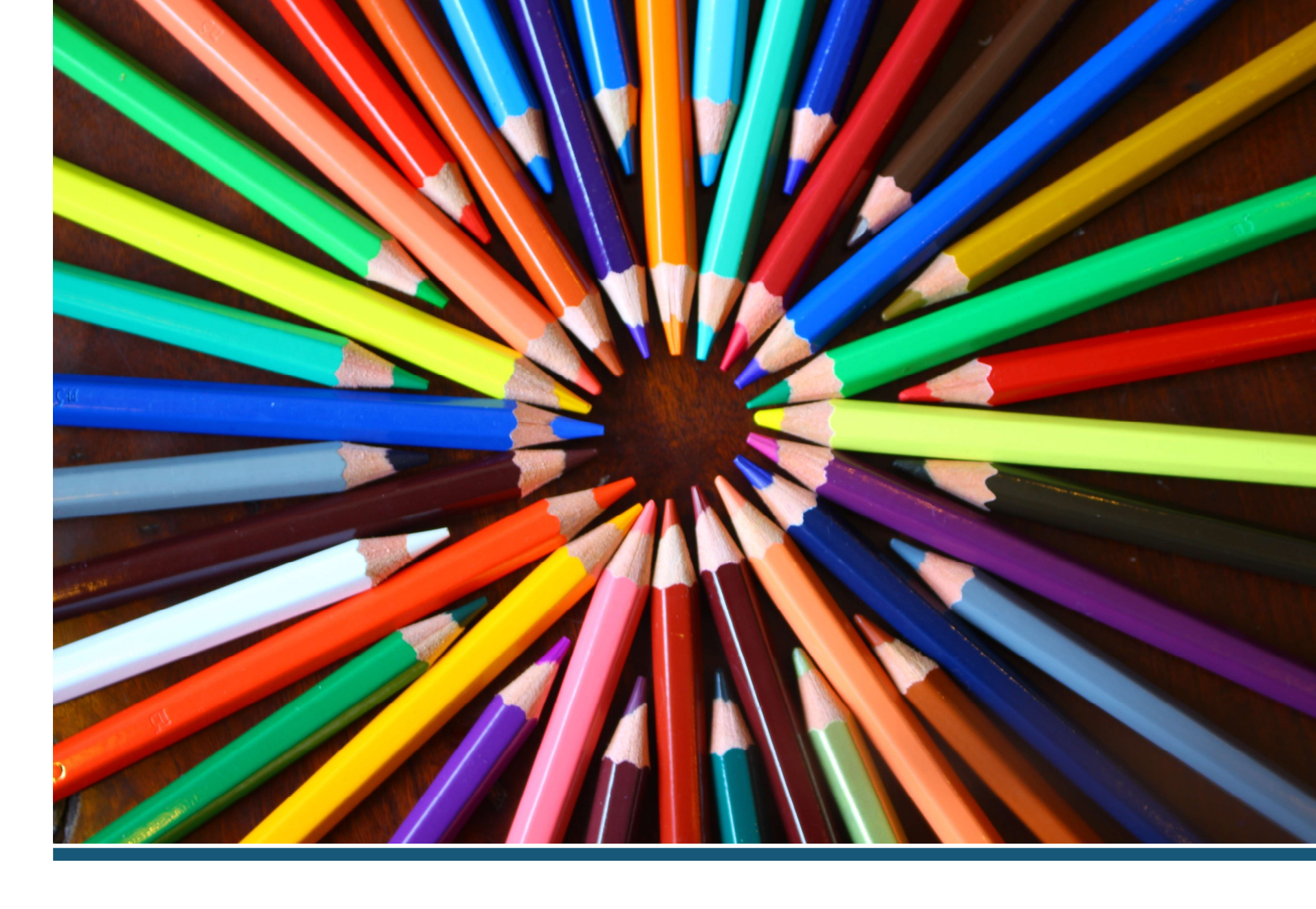
JOIN US FOR THIS EXCITING JOURNEY OF GROWTH