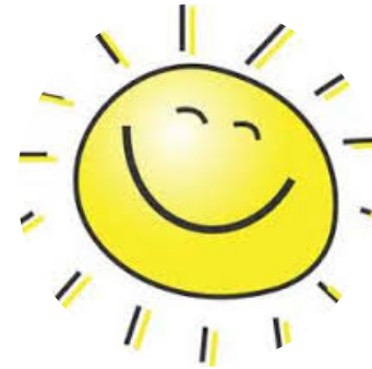
Plan Summer Schedules