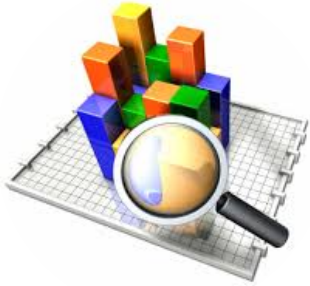
Analyze Your Data