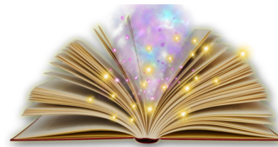
Refine & Enhance Your Story