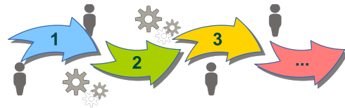
Adjust Testing & Requirements