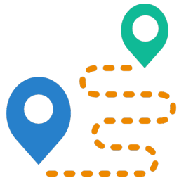
Adjust Tour Routes