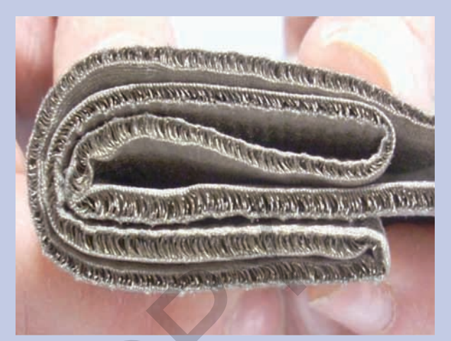
Figure 2. The 3D delivery system is designed to maintain an ideal moist, but not wet, healing environment.

The effectiveness of ionic silver as an antimicrobial is well established.<sup>4,5</sup> Silver is an effective antimicrobial agent with low toxicity, which is important especially in the treatment of burn wounds where transient bacteremia is prevalent and its fast control is essential. Drugs releasing silver in ionic forms are known to get neutralized in biological fluids and upon long-term use may cause argyria and delayed wound healing. Given its broad-spectrum activity, efficacy, and lower cost, the