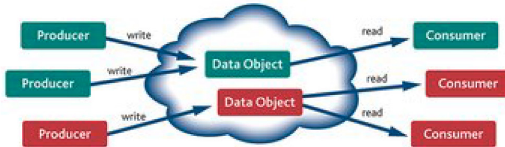
Figure 2. Example QoS capabilities and requirements for publishers and subscribers.

As another example, the Insitu ScanEagle long endurance UAV uses DDS on the vehicle itself and in the ground control stations (Figure 2). On the airframe, DDS connects the flight computers, sensors, and onboard application computers. Within the ground station, DDS connects the systems that decode data feeds, analyze the UAV's situation, and interface to the operator control. DDS implements a hierarchical control network with well-controlled data flows. This allows Insitu, for instance, to seamlessly switch control between multiple ground stations and to reliably connect to the aircraft over unreliable low-bandwidth links.