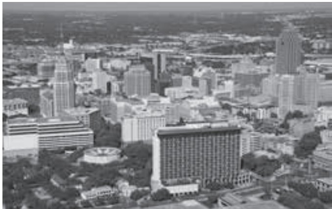
San Antonio is a warm, bustling city of 1.4 million people.

Located in south central Texas, San Antonio experiences an average year-round temperature of 70 °F. In April, the average high temperature is 80 °F; the average low is 57 °F. April usually experiences little rainfall—only 2.6 inches on average for the entire month.