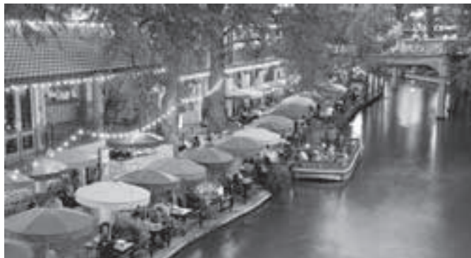
San Antonio's River Walk, shown at dusk, is a popular tourist destination where visitors can walk, dine, and even boat.