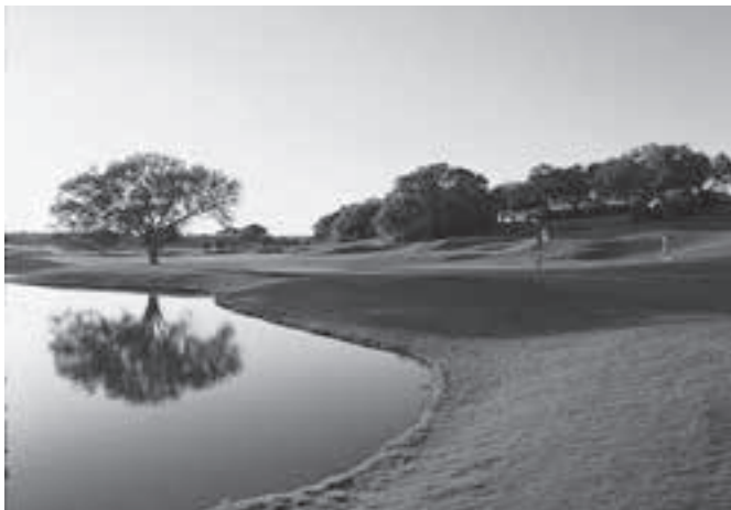
The Hyatt Hill Country Golf Club's course features a variety of shot challenges and strategically-placed bunkers and grassy hollows.

This 10,369-yard course is beautiful, dramatic, and balanced. It has rolling meadows, steep hillsides, wooded ravines, and tree-shaded plateaus as well as the tranquil threat of lakes and ponds.