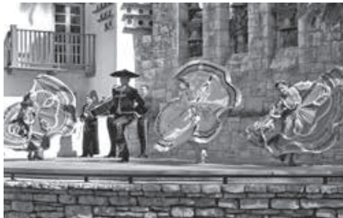
Dancers perform on stage at the Arneson River Theater during Fiesta San Antonio.

The Annual Meeting coincides with San Antonio's largest public festival: Fiesta San Antonio. The annual festival runs from April 16-26 in 2015, and events take place across San Antonio including at locations in walking distance from the Marriott Rivercenter. Fiesta San Antonio started more than 120 years ago as a parade to honor the memory of the heroes of the Alamo and the Battle of San Jacinto. It's since grown to a citywide, 10-day festival featuring about 100 events that offer music, food, sports, pageantry, military observances, exhibits, and parades.