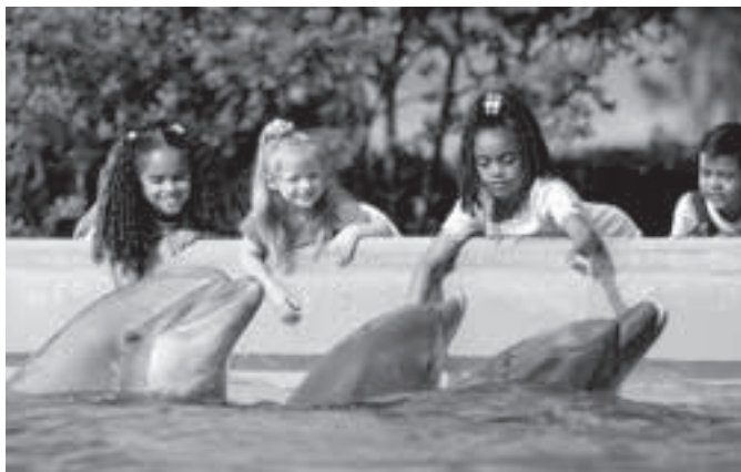
Children touch dolphins at SeaWorld San Antonio.

The world's largest marine life park lets visitors meet Shamu, feed dolphins, and more. Aquatica, SeaWorld's waterpark, is designed as a South Seas oasis with all the amenities of a beachside resort including terraced pools, a giant wave pool, meandering crystal-blue rivers, sandy beaches, and private cabanas.