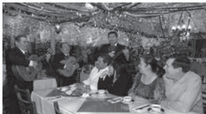
A musical trio sings to a group of guests in the main dining room of Mi Tierra, a popular restaurant known for its festive decorations and on-site bakery.

Make sure to try the homemade Mexican candy.