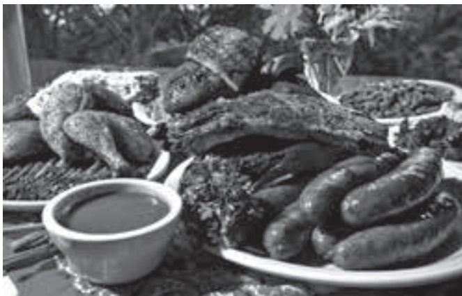
The County Line restaurant serves up all-you-can-eat BBQ platters, family style.

It's been located on the River Walk for nearly 30 years. Be sure to try the jalapeño hush puppies with wild pork sauce. Gluten free items are available.