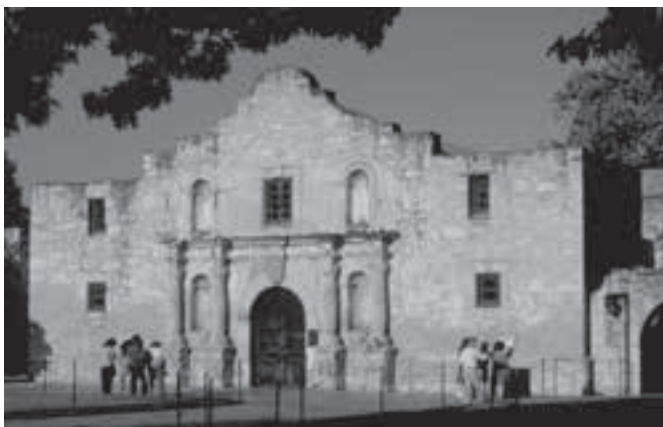
San Antonio's Alamo, a Spanish mission that played a key role in Texas' independence from Mexico, is shown at dusk.

More than 2.5 million people a year visit the 4.2-acre complex known worldwide as "The Alamo." For more than 300 years, the Alamo has been a crossroads of Texas history. Here Spanish colonization took hold and Mexico later armed its independence. Still later, a small band of Texans held out for 13 days against the large army of Mexican Gen. Antonio López de Santa Anna. Texas eventually declared independence from Mexico and became the 28th U.S. state in 1845.