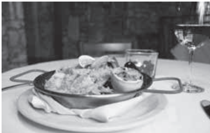
The River Walk's Bella on the River restaurant offers unique dishes like seafood paella.

Bella's small and intimate wine bar and dining room are unique and special on the River Walk. Dressy attire suggested.