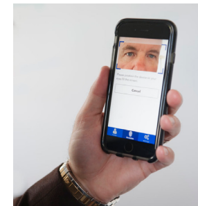
At BioConnect, the Future of Online Security is in Your DNA Bay Street Bull