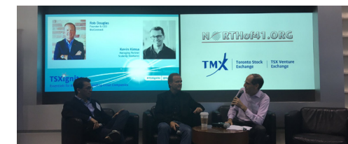
TSX Ignite: CEOs Unplugged Toronto Stock Exchange