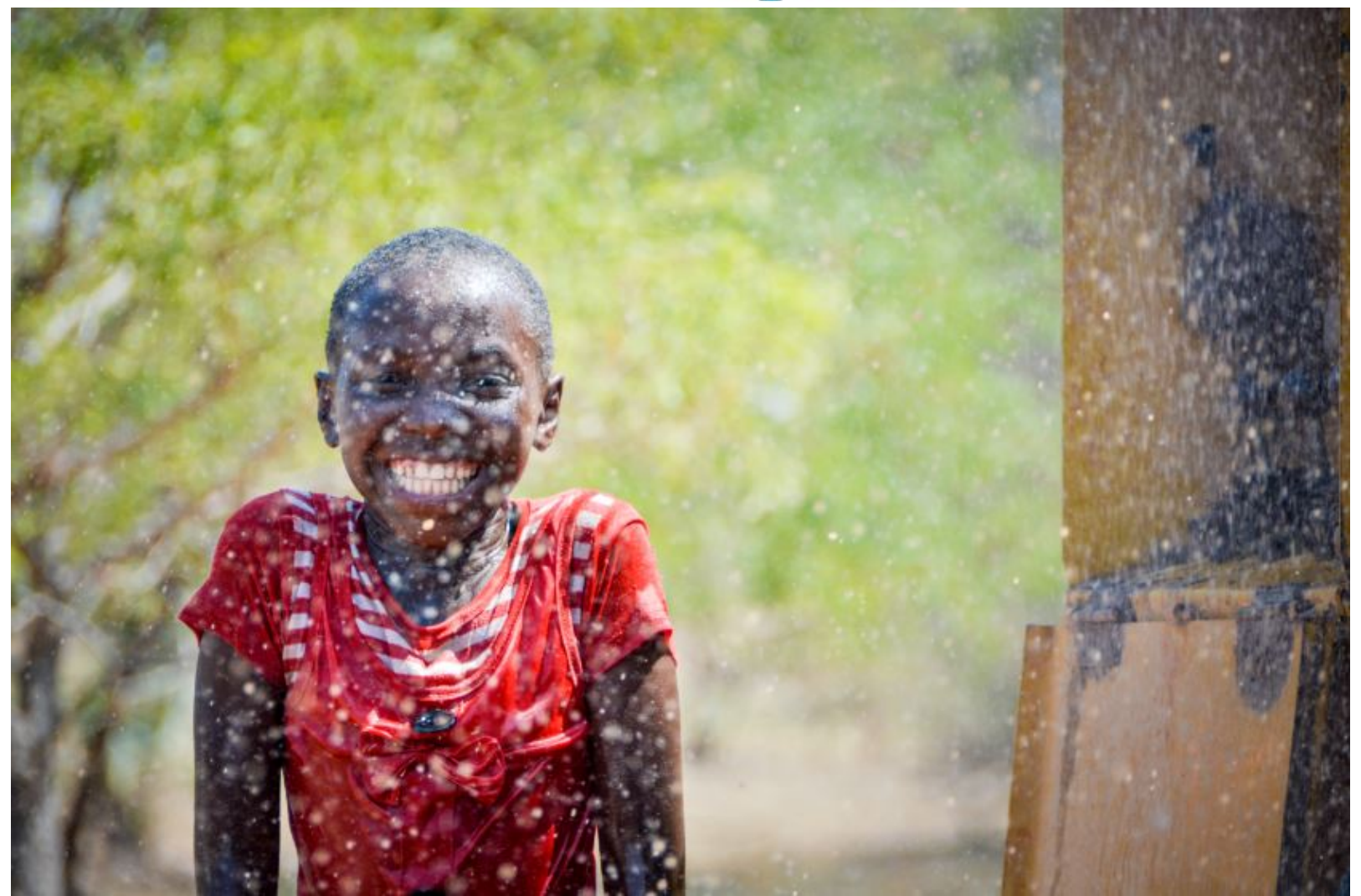
World Vision Partners Make New 2020 Commitment

Based on our remarkable success in 2016, we have revised our goals for 2020. Using our business plan approach for each region in which we work, we have developed a new and more aggressive 5 year plan. Our new commitment is to reach more than 20 million people by 2020.