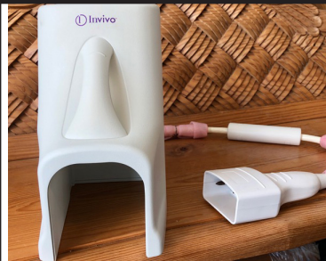
SN 694 DOM: Dec 2008