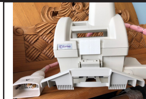
SN 37630 DOM: April 2013