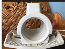
SN 38885 DOM: May 2015