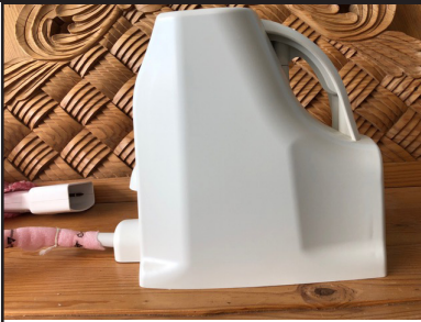
SN 2413 DOM: Nov 2014