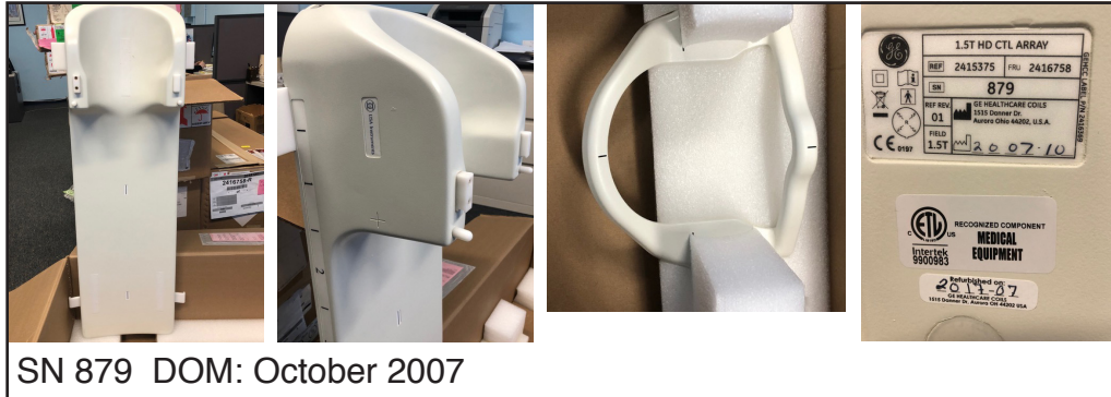
SN 879 DOM: October 2007