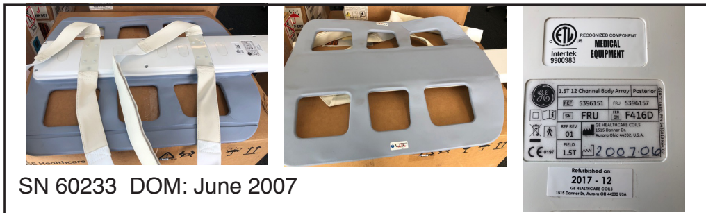
SN 60233 DOM: June 2007