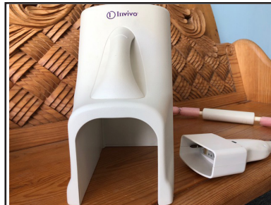
SN 1601 DOM: April 2014