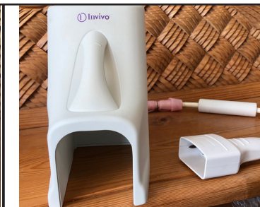
SN 2817 DOM: May 2016