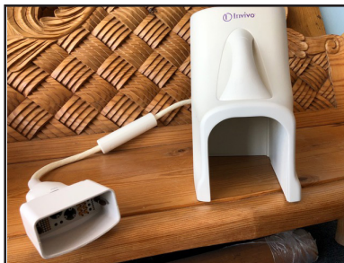
SN 464 DOM: April 2010