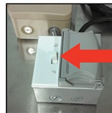
MOMENTARY SWITCH Figure B

Any questions or concerns, please call Holganix at 866-563-2784 or email SUPPORT@holganix.com