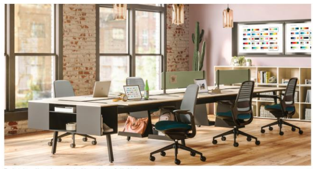
Product pictured is not the exact style of the product studied in this document.