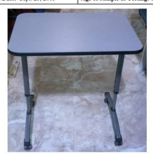
Paragon Furniture AND Crossfit Flip Top Student Desk as tested

Testing was initiated by placing the desk inside MAS's full-scale (28.3 cubic meter) stainless steel emissions chamber. The desk was placed in the center of the chamber floor beneath ceiling mounted recirculation fams to facilitate even air movement around the sample during testing. Air flow to the chamber was reduced to one-quarter air change per hour as required under ANSI/BIFMA M7.1-2011 Section 8.2.