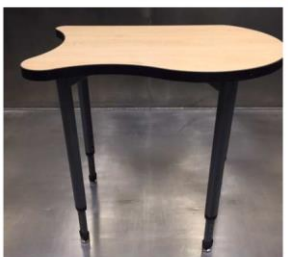
Paragon A&D® Adjustable Height Student Desk in chamber