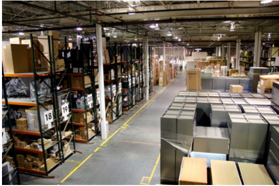
▲ Red Thread Wilmington Warehouse

Need furniture or technology fast to support a growing team? Our rental services help you address short-term needs while seeking the best long-term solution. Whether you need one or 100 workstations, a projector or flat screen, we offer affordable solutions and flexible terms of one day, one month or one year. With the widest range of product solutions and fast and reliable delivery, we are positioned to meet all of your rental needs.