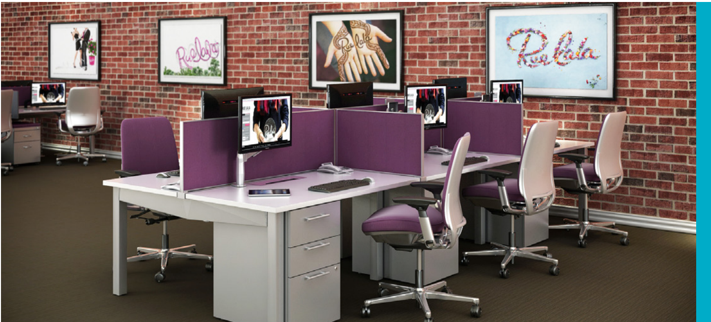
Sample Workplace Rendering | © Red Thread