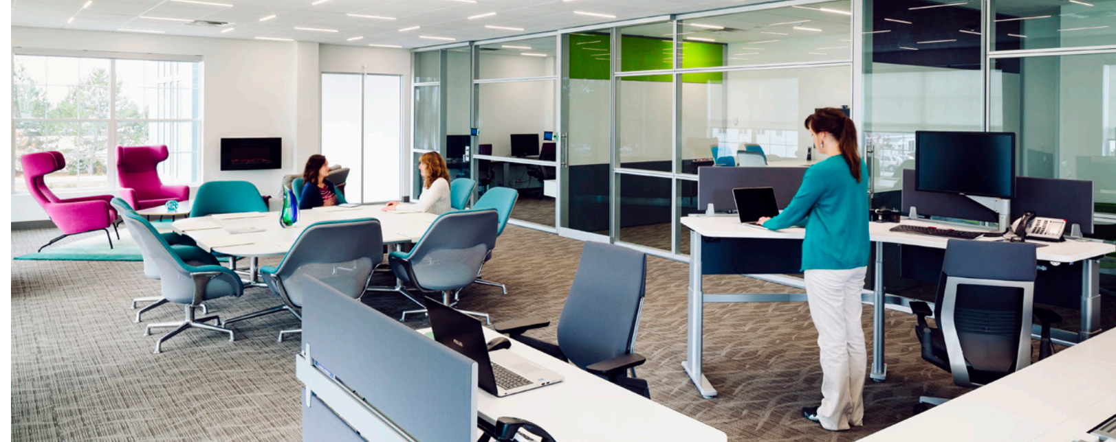
Town & Country Federal Credit Union