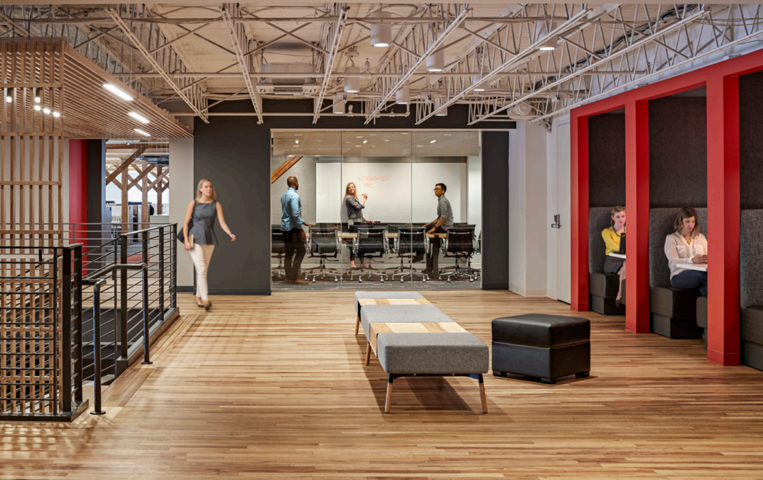
Shawmut Design and Construction | © CBT Architects | Robert Benson Photography