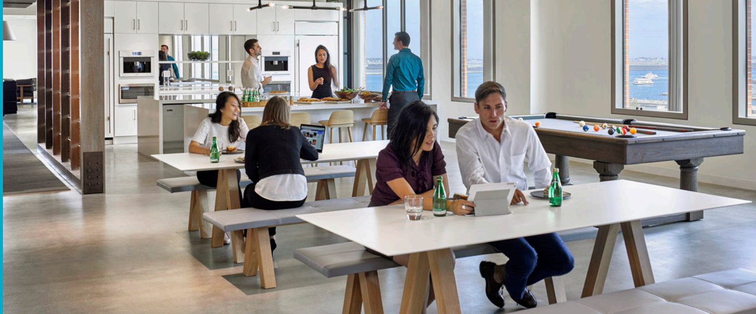
Potamus Trading