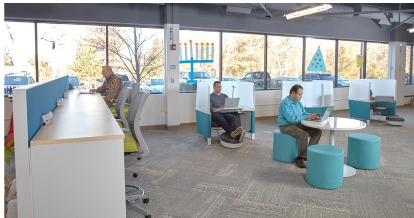
Open Collaboration; benching, Brody WorkLounges and casual work settings

For the first time, employees could see each other, from one end of the space to the other. Workstations shrunk to 7' x 7.5' for engineers and 6' x 7' for all other employees in order to create informal collaborative areas, including huddle seating, tables and whiteboards. One of the highlights of the revamped individual workstations is the fully height adjustable worksurfaces and monitor arms that support postural shifts throughout the day.