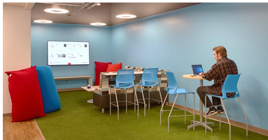
Casual open collaboration