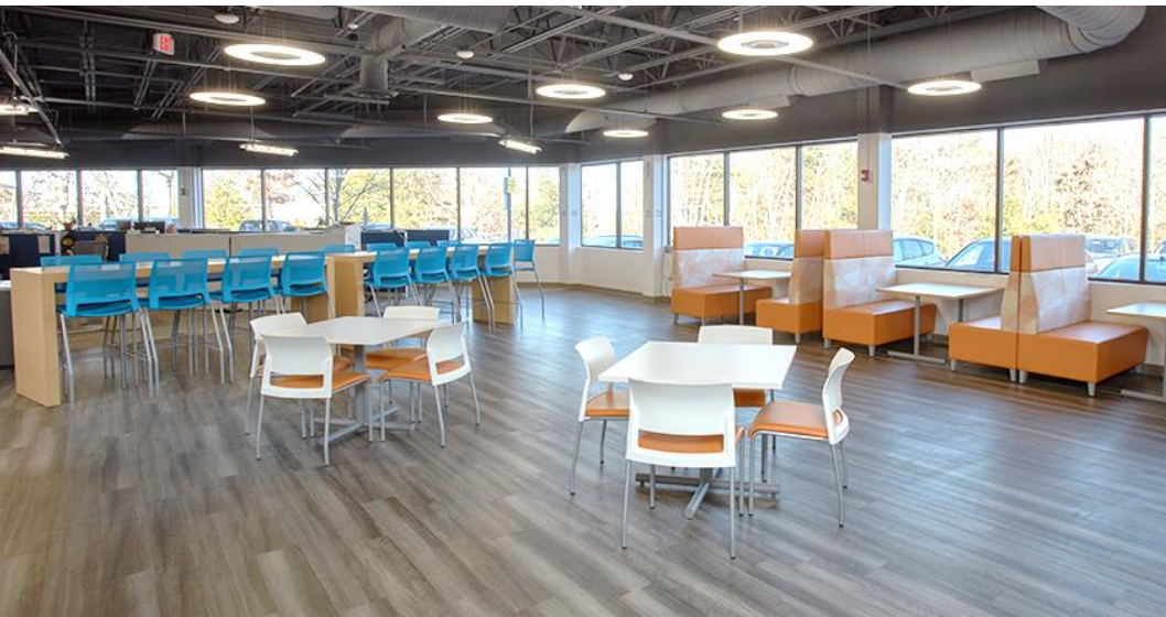
Work café; High top tables, booths and movable tables