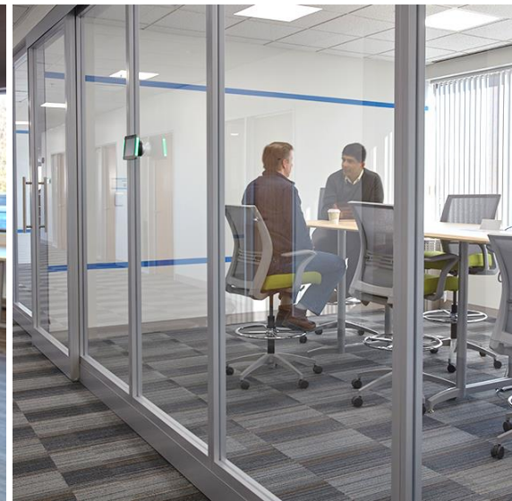
Enclosed spaces with Privacy Wall/Glass Selections, RoomWizards and Barco Clickshare

With smaller workstations, the space was designed in zones to provide many options for working away from dedicated workspaces.