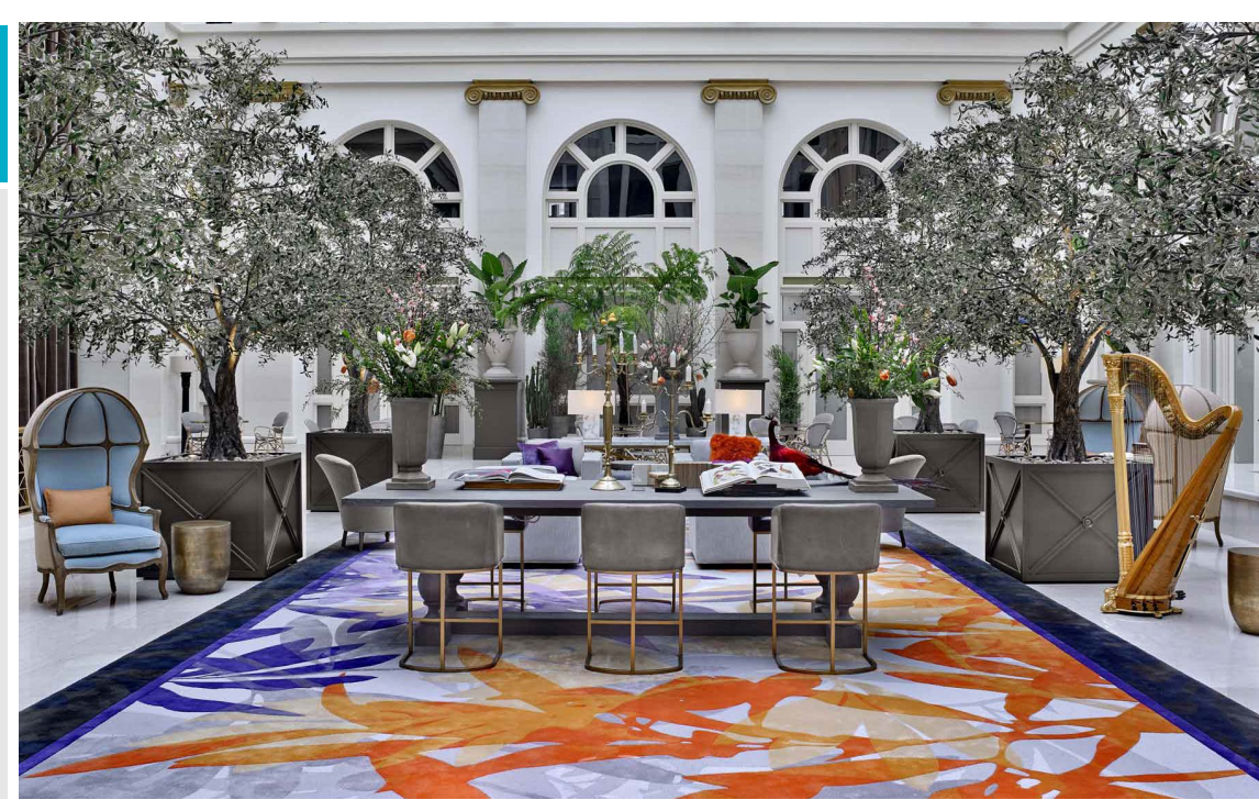
Garden Retreat | Photos © Eric Laignel