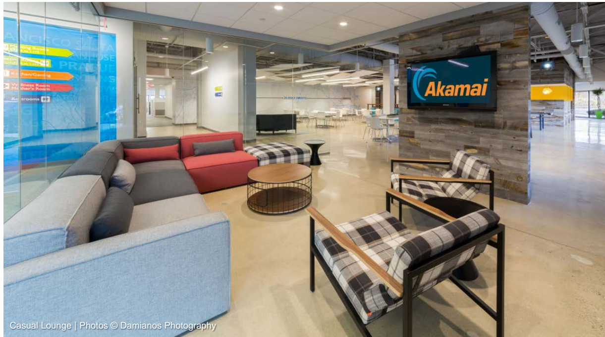
Casual Lounge

Akamai, a leading provider of content delivery network and cloud services, pushes the envelope of workplace design at their satellite office in Westford, MA—not only to engage the people working in this space but also to help them to feel part of the team. From the Central Hub, for casual and social gatherings, to the Mobility Area, with a variety of work settings, the space combines Akamai's techy culture with a casual residential atmosphere. The result is a vibrant and inspirational place for people to work, collaborate and socialize with colleagues.