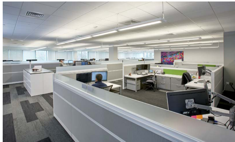
Neighborhoods of 6x6 work spaces