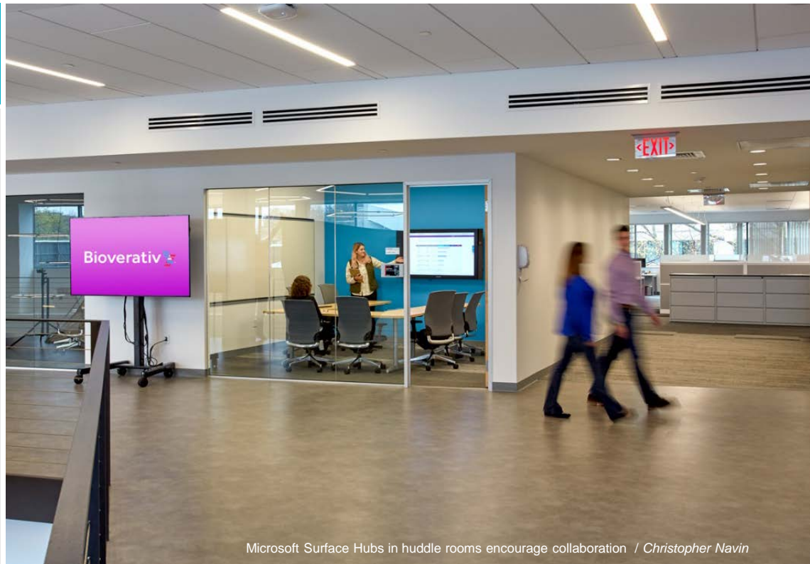
Microsoft Surface Hubs in huddle rooms encourage collaboration / Christopher Navin