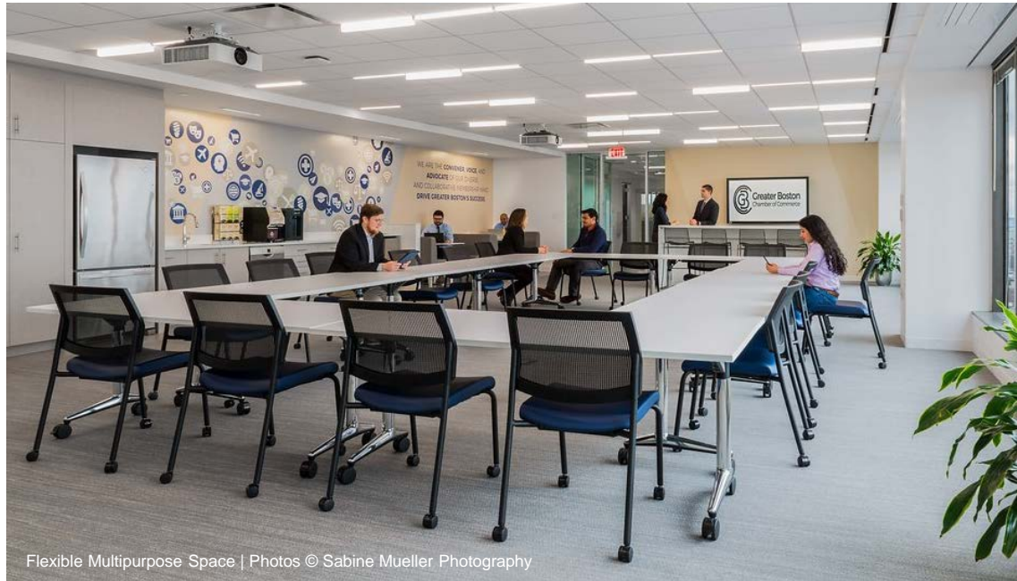
Flexible Multipurpose Space