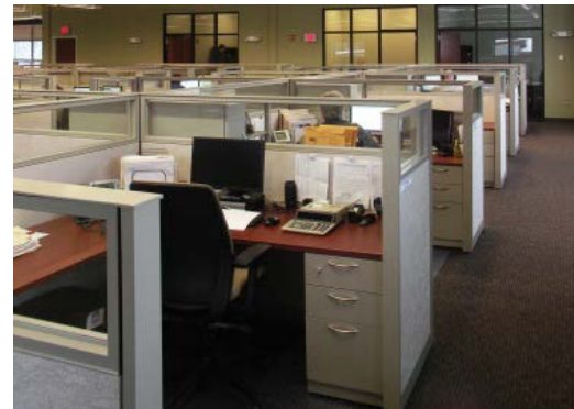
Open plan work area

“ After listening to our needs, concerns and budget considerations, the team at Red Thread was able to develop solutions that fit our goals. We were very pleased with the overall appearance and functionality of the components that they recommended and installed at our new operations center. ”