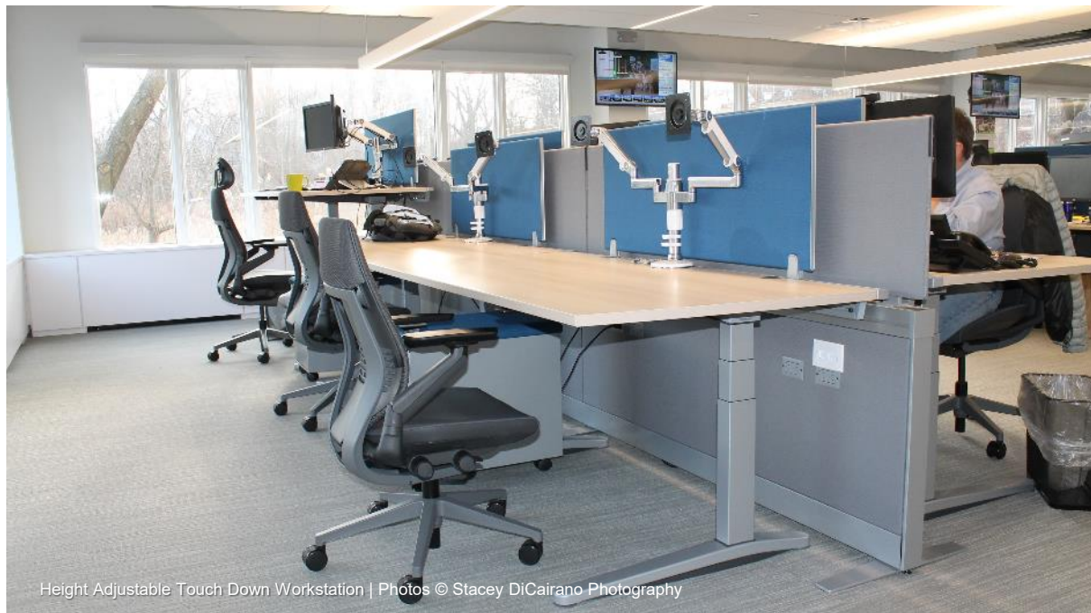
Height Adjustable Touch Down Workstation

IXM, formerly the metals business of trading house Louis Dreyfus, was recently acquired by CMOC. It has established its US office in Westport CT and resides at Baywater Property's waterfront space at 355 Riverside. This space takes advantage of natural light and sweeping views of the Saugatuck River. The design intent of the space was focused on fostering collaboration, team building, ergonomics and flexibility. The open plan naturally encourages communication and impromptu conversation, while individual workstations are designed for focus with privacy panels. Employees are encouraged to move throughout the day, from lounge soft seating and conference rooms to the high top café for informal gatherings. Movement is also supported in their individual workstations with height adjustable worksurfaces and dual monitor arms. All solutions can easily be relocated within the space to support future space designs and growth.