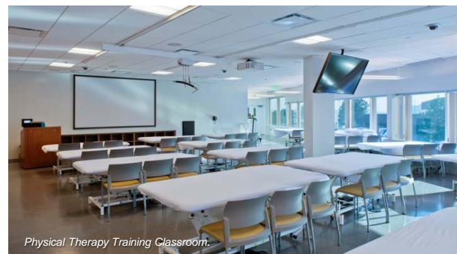
Physical Therapy Training Classroom.