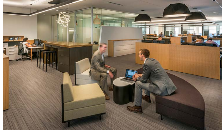
Informal collaboration with the open plan

NKF's space represents a newly blended team and culture of openness and collaboration. In the welcome center, colleagues and guests can connect socially around a custom granite standing-height table. Casual, open meeting spaces allow for frequent, easy communication and create a welcoming environment where people can work collaboratively.