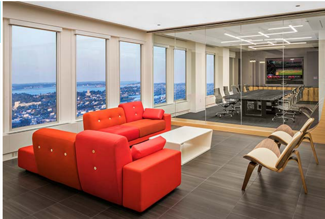
Lobby and Conference Room