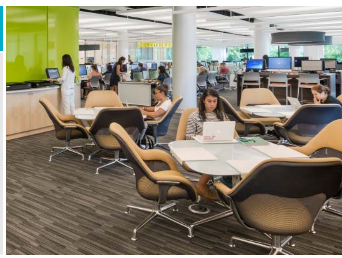
A palette of informal collaborative settings for individual and group work

Information Area | Computer Lab Classrooms | Presentation Rooms Collaborative Areas Project Team Rooms