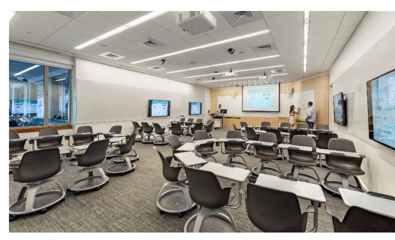
Active learning classrooms easily transition among lecture, discussion and collaborative modes

A classroom wing outfitted with portable Node chairs creates a flexible Active Learning environment. Students and faculty are able to quickly transition between lecture, discussion and team learning modes.