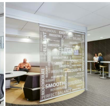
Media:scape with Post+Beam