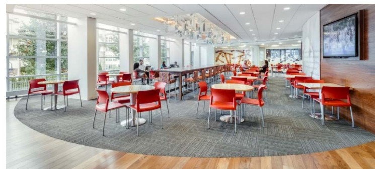
Work Café with inlaid flooring