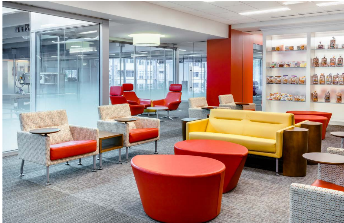
Lounge space

Furniture Architectural Solutions Custom Solutions Flooring Move Services