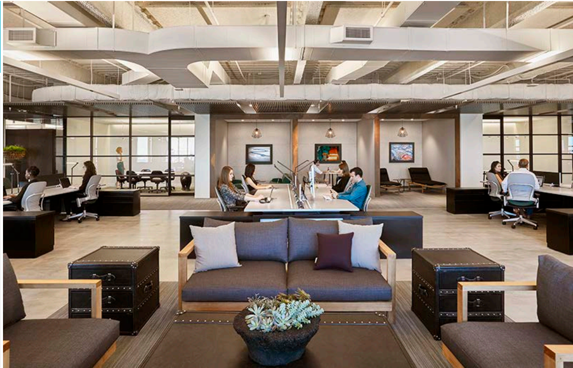
Ecosystem of spaces: trading desks, lounge areas and meeting rooms