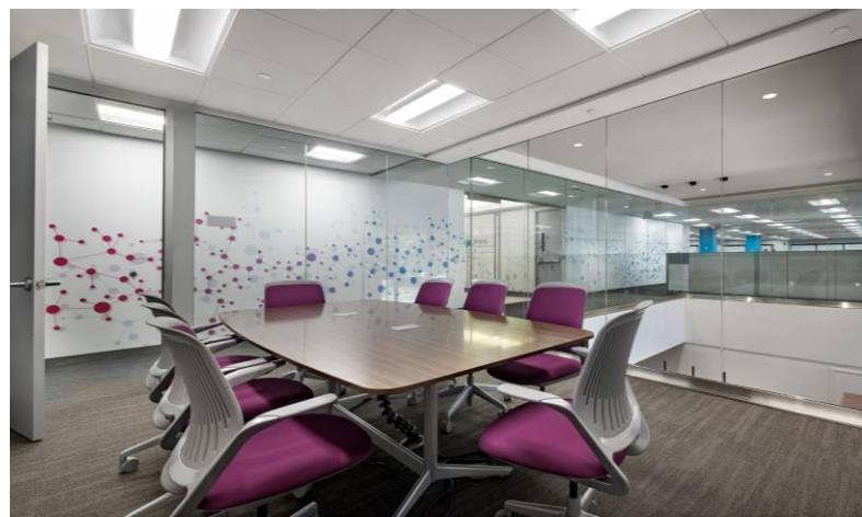
Conference setting with visual transparency to others.

RWS Life Sciences' people perform very technical work so they need workstations that support extreme concentration and long-term occupation. Ergonomic solutions were used to create spaces that are comfortable and easily customizable. Adjustable height desks, monitor arms, and high-quality chairs support well-being and allow for individuals to fine-tune their settings to their own wants and needs. In the new space, partitions were lowered just enough to encourage collaboration while still providing the necessary amount of privacy and sound blocking. People were strategically re-located to achieve the environments necessary for their work; Editors sit together which creates a quieter environment and allows them to focus.