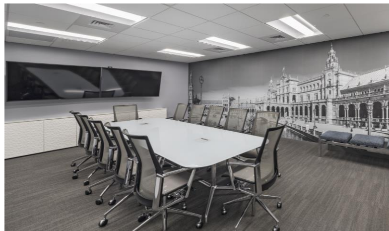
Meeting Room with integrated technology and vibrant graphics