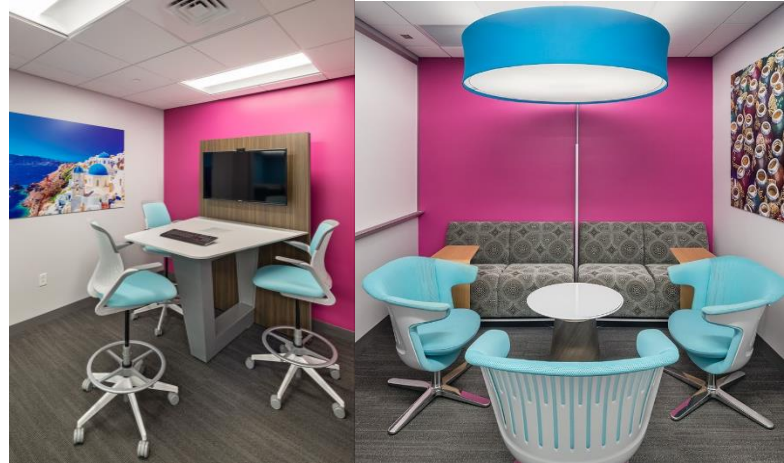
Collaborative soft seating

In the old space, communication was email centric; now employees walk over and relay information in person. With the new space, employee interaction has increased. Lower panels and collaborative spaces have encouraged people to get together and share ideas. Ergonomics have helped improve quality of life at work and overall, morale has increased significantly. The walls are covered in graphics in the company's colors and photographs of different global destinations, a reminder of the importance that global connectivity has on their work. Life Sciences RSW has used their new space to achieve their goal of happy employees and a tight knit community.