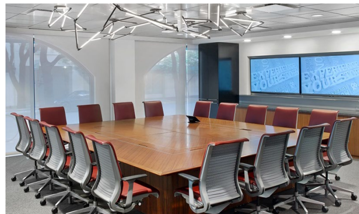
Custom conference room table with Steelcase Think chairs

Customers visiting the Grove experience the creative process while touring the space. A colored line in the carpet serves as the path to view production teams working in real time. The first stop is the editing bays and web design suites, designed to look like large shipping crates. As clients walk through the open plan, they observe different teams collaborating. When it's time to impress, Sapient uses the "pitch room," which immerses and engages clients in ideas presented on wall-to-wall displays. The tour concludes in the movie theater—the stage for displaying clients' final deliverables.