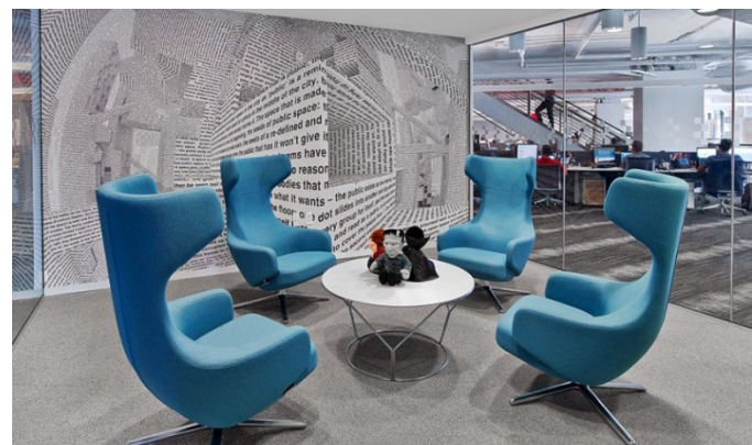
Small huddle room allows for casual collaboration