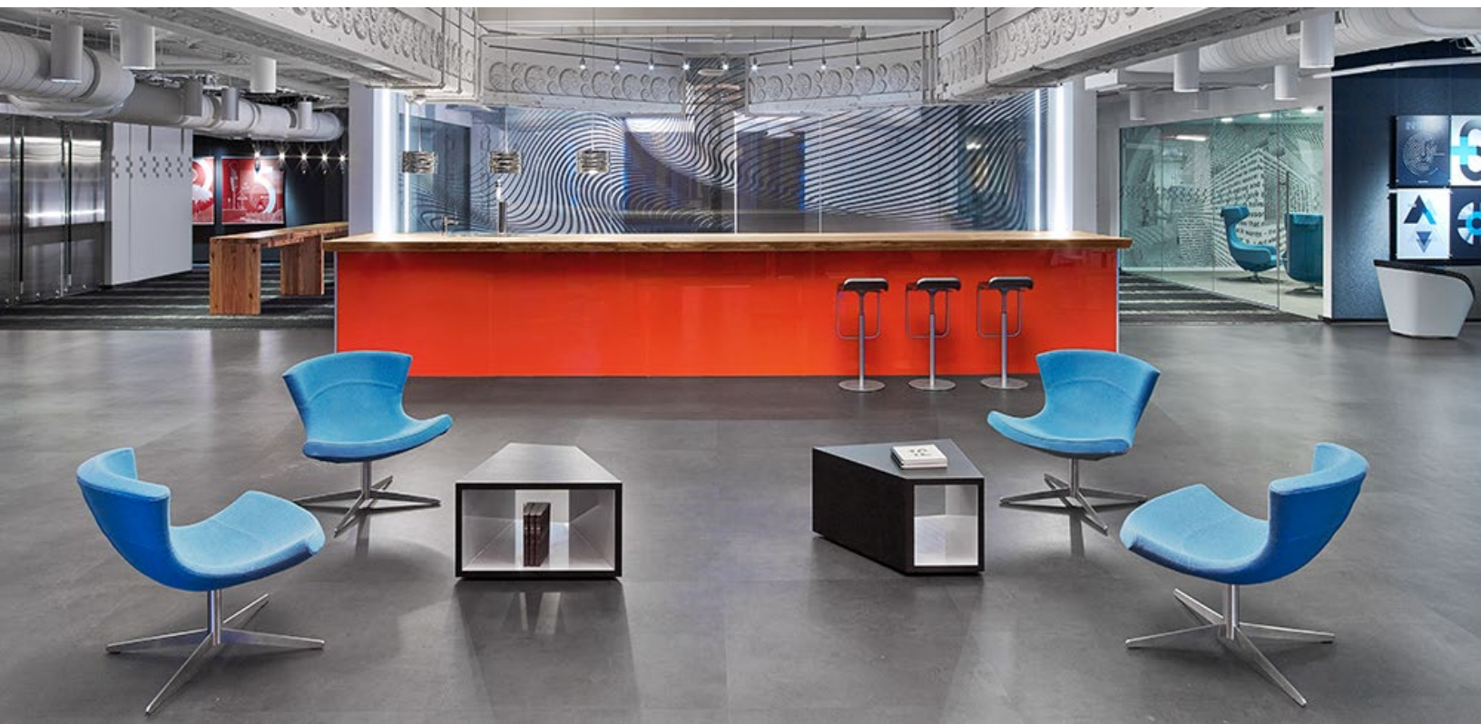
Lobby is welcoming for employees and clients alike