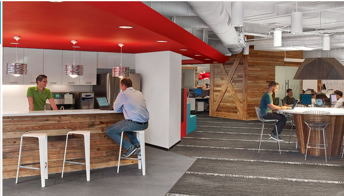
Work café fosters collaboration and socialization | Photos © IA Interior Architects