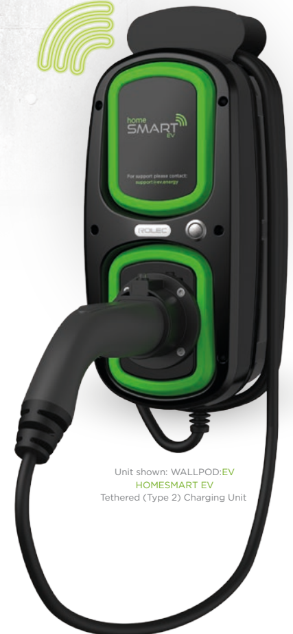
Unit shown: WALLPOD:EV HOMESMART EV Tethered (Type 2) Charging Unit

The WallPod:EV HomeSmart is a smart charging unit which has been designed to provide the user with a simple, mobile phone interactive EV charging solution for the home.