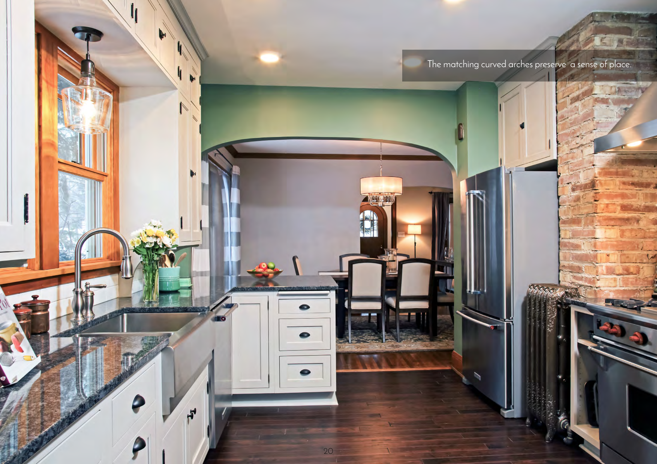
The matching curved arches preserve a sense of place.