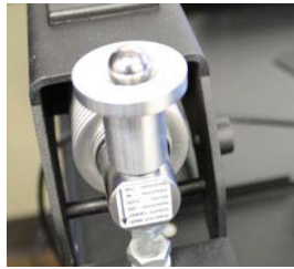
Load cell ball