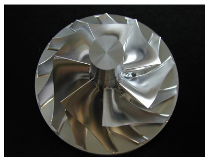
Photos are development parts for passenger-car compressor wheels.