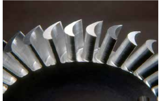
Axial blade row designed with AXIAL.

AXIAL utilizes integrated performance map plotting. Users can view blade angles and velocity triangles at the rotor inlet and exit, as well as view results in a flexible spreadsheet-like table view. Tables are customizable through separate filters, with the user able to create any number of filters, select what to display, and customize the labels as well.