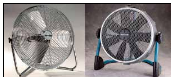
Previous generation Holmes High-Velocity Floor Fan (left) compared to quieter and more efficient new design (right).