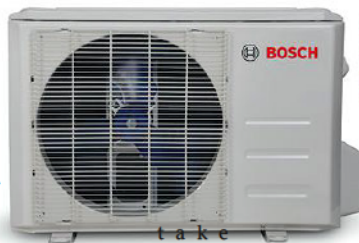
The Climate 5000 Ductless Minisplit Heat Pump System is ideal for residential heating and cooling up to 48,000 Btuh.