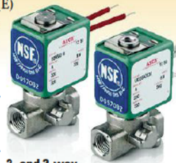
2- and 3-way subminiature solenoid valves, ideal for potable water and food service applications, from the ASCO unit of Emerson.

Rinnai had two major launches at AHR, the I-Series Boiler and the Demand Duo 2. The I-Series can allow for simultaneous home heating and domestic hot water production. If the heat is running and someone in the home wants a shower, the heat is not interrupted. The technology also includes an innovative bypass servo valve, which enables precise control of the hot water temperature. The boiler is available in both combi and heat-only models and comes