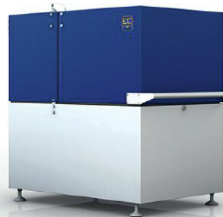
The micro-CHP (Combined Heat & Power) XRG1 25 cogeneration system.

standard with multi-zone heating control.