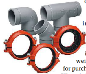
Installation-ready couplings from Victaulic.

Viega's MegaPress technology is now available for stainless steel pipe up to 4". Three new fitting