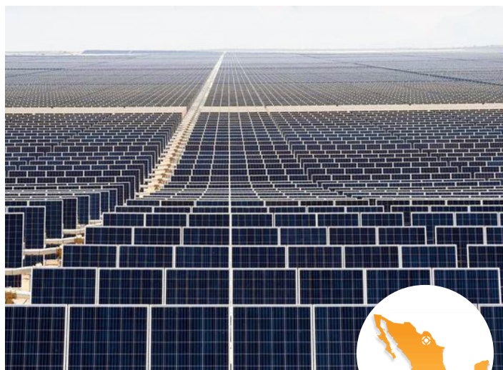
Villanueva Solar Power Plant, Northern Mexico. 828 MW with NX Horizon Smart Solar Tracker using NX Data Hub.