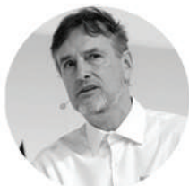
Jürgen Schmidhuber Deep-Learning Expert IDSIA