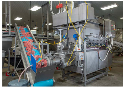
Chilled ground beef exits the mixer equipped with KRYOJECTOR injectors at right.