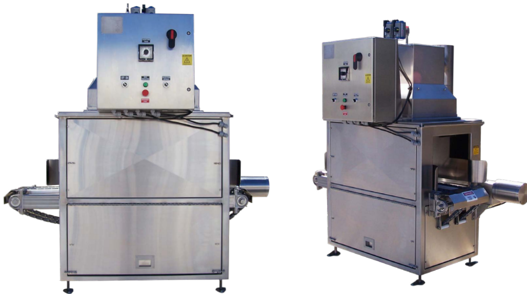
Automated Box Chilling System with exhaust hood.