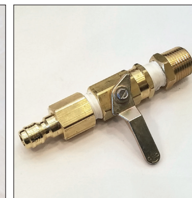
Inline shutoff valve