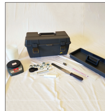
Universal density kit