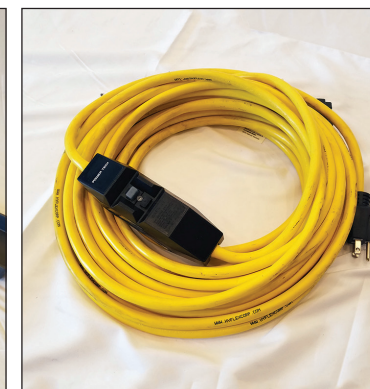
50 ft 12 ga heavy duty cord with GFCI