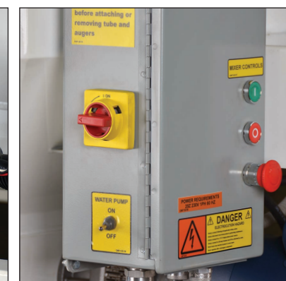
Simple, easy-to-use controls