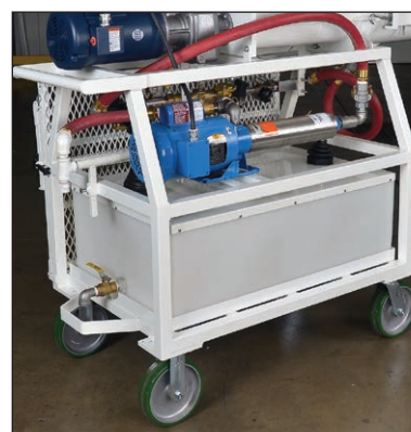
Onboard water pump and tank