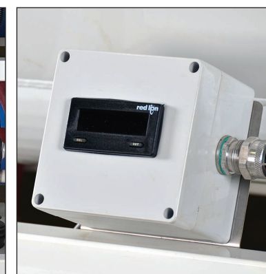
Digital water meter