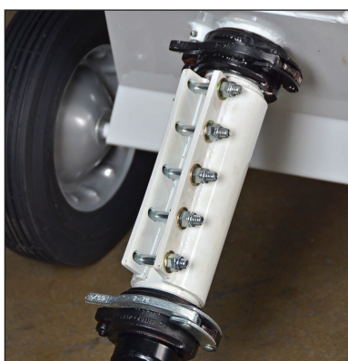
Clamp on and adjustable stator tube design for fast cleaning and long life