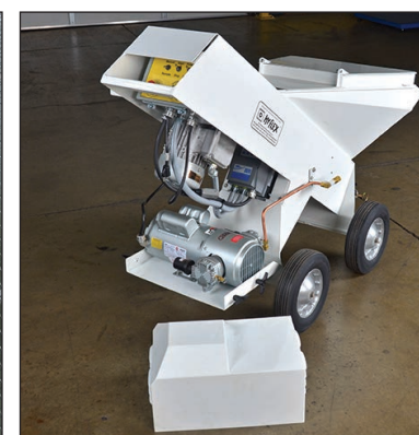
Removable steel cover protects optional air compressor from damage