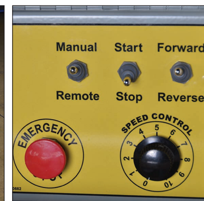
Simple, easy-to-use controls