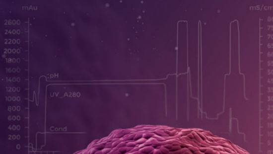
TYPICAL CHROMATOGRAPHY PROFILE

Our commitment to deliver on your project is prioritized across our entire organization.