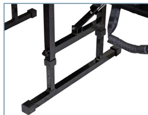
Height Range: 18.5-22.4"