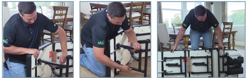
Adjustable Height Folding Legs