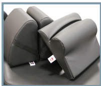
Knee & Cervical Bolster Set