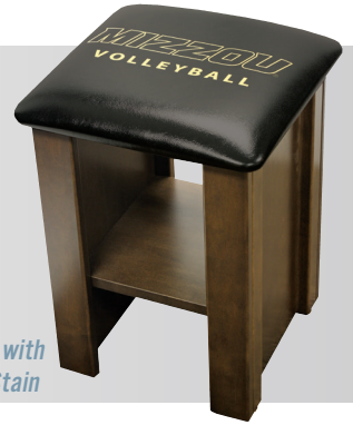
ST2-LOGO with Custom Stain

The Premium Wood Stools are a stylish 4 pillar frame construction that is functional and a durable accessory for your facility. Give your stool a unique look with custom branding. Premium wood stools are available in multiple wood options with a natural moisture-resistant lacquer finish and include a 1.5" high density foam cushion.