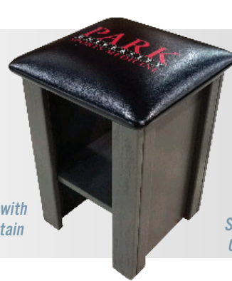
ST1-LOGO with Custom Stain